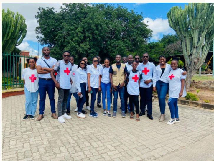
Marking Youth Day 2025: ZRCS Volunteers in Monze District Lead Celebrations, Highlighting Youth Engagement in Humanitarian Action

2025 YOUTH DAY THEME: "VOICES AMPLIFIED AND INNOVATIONS IGNITED."