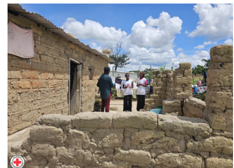
ZRCS Volunteers Lead Mpox Sensitization in Kalumbila District: Our dedicated Volunteers Conducting Door-to-Door Community Outreach in Kalumbila, Providing Mpox Prevention Education to Curb Transmission and Address Public Concerns