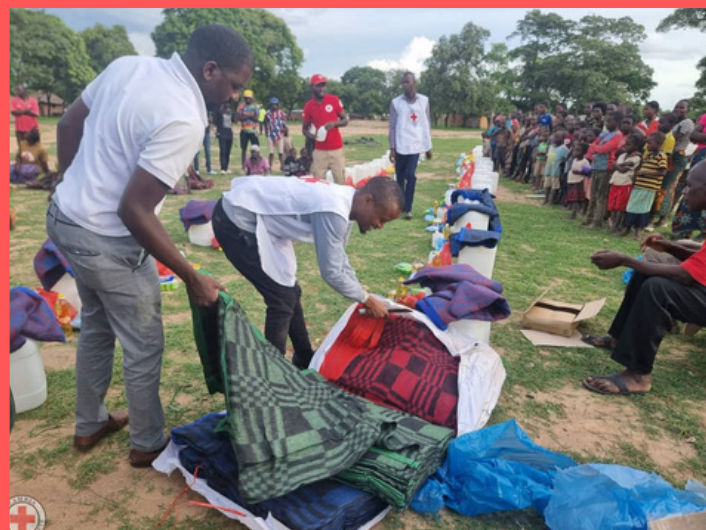
ZRCS Distributes Emergency Supplies (Chlorine, Water Storage Containers, Blankets & Hygiene Kits) to Flood-affected Families in Nyimba, Eastern Province

This integrated approach enabled the communities meet their immediate needs and also preparing them for long term interventions.