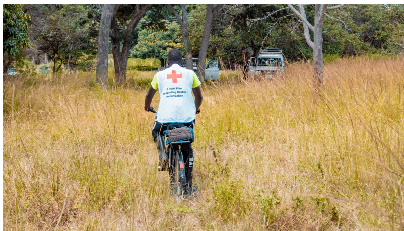
3ZRCS volunteers Using Bicycles to Reach Remote Communities as Part of the 5 Point Plan Mapping Exercise