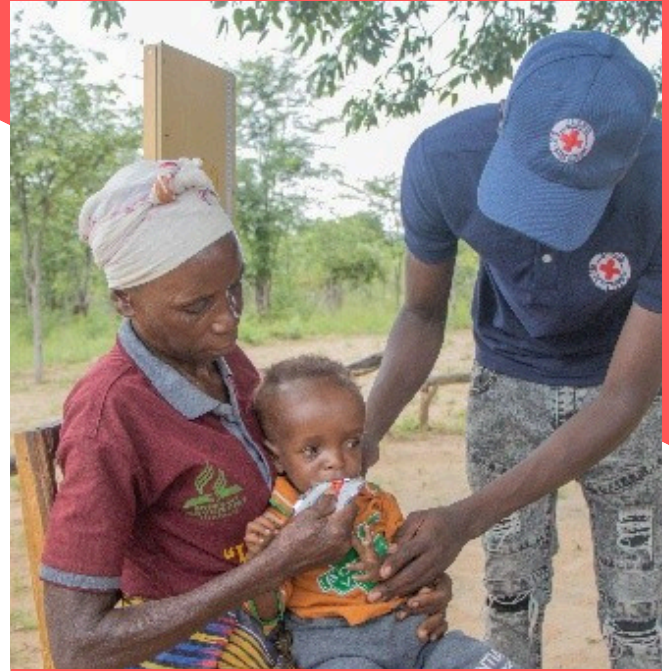
A mother Feeds Her Child Plumpy'Nut, A Nutritional Supplement Aimed at Helping Malnourished children in Sinazongwe District, Southern Province

ZRCS remains committed to addressing food insecurity and malnutrition in drought-affected regions. Through partnerships and targeted interventions, we're ensuring that communities receive the support they need to recover and thrive.