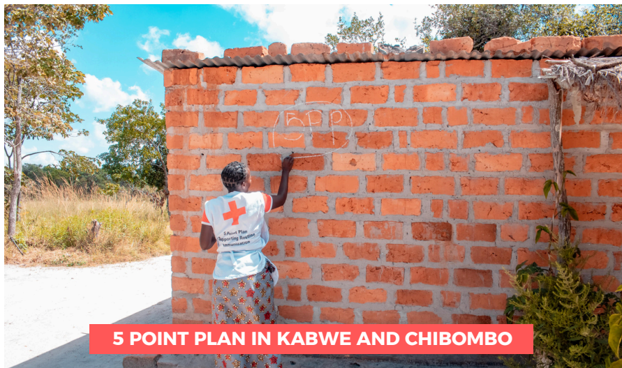
5 POINT PLAN IN KABWE AND CHIBOMBO

We are excited to share updates and stories from the heart of humanitarian action and community resilience during the first quarter of 2025. From January to March, we remained steadfast in our commitment to transforming lives through innovative and sustainable solutions that uplift the well-being of those we serve. In this newsletter, you'll find inspiring stories of hope, updates on our programs, and enhancement on our mission which is to save and improve the quality of life of vulnerable communities in Zambia. From disaster preparedness and response to health initiatives and community infrastructure development, we highlight the incredible impact we are making in people's lives.