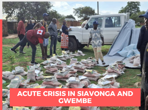
ACUTE CRISIS IN SIAVONGA AND GWEMBE