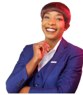
Quiley Sipumo National Youth Chairperson