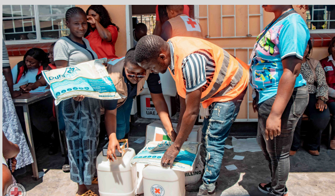
Flood Affected families at in Chaisa Receiving Relief items Donated by ZRCS and DMMU

On February 26, 2025, Zambia Red Cross Society (ZRCS) provided essential relief items to families displaced by floods in Lusaka and Chilanga districts. Heavy rains destroyed homes, forcing many residents to evacuate.