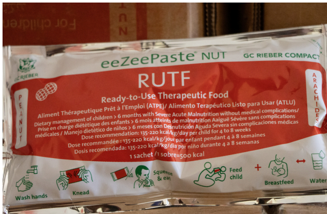
Plumpy'Nut Packs Donated to Sinazongwe District Health Office