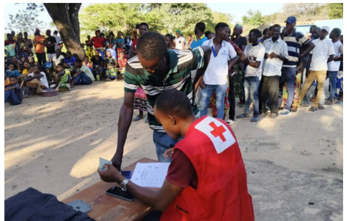
ZRCS Teams Conduct Beneficiary Verification Before Distributing Vital Farming Inputs to Drought-affected Families in Siavonga and Gwembe.

This initiative addressed immediate food needs and also strengthened long-term resilience against climate shocks. By equipping farmers with tools and knowledge, ZRCS is paving the way for sustainable agriculture and food security in drought-prone regions.