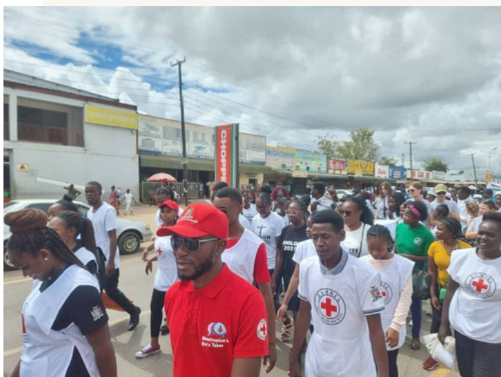
ZRCS Volunteers in Monze District Commemorate Youth Day 2025 – Showcasing the Vital Role of Young Humanitarians in Community Development

As we reflect on Youth Day 2025, ZRCS reaffirms its commitment to nurturing young leaders who will shape the humanitarian landscape. Together, we are amplifying voices and igniting innovations for a better tomorrow.