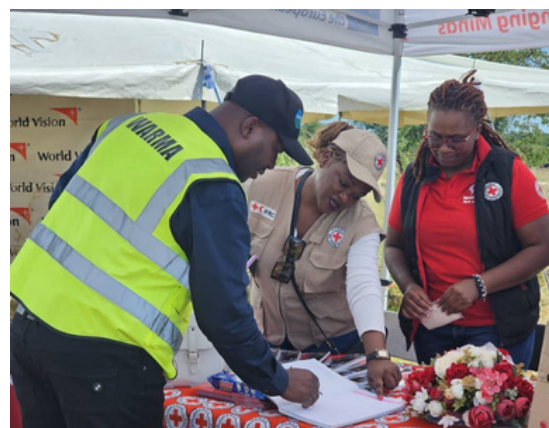
ZRCS Joins Global World Water Day Commemoration, Showcasing Sustainable Water Solutions