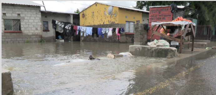
Flooded Affected Homes in Kanyama, Lusaka, After Heavy Rains Left Homes Submerged and Families Displaced.