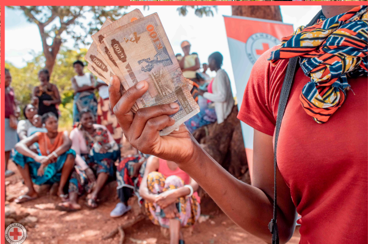
ZRCS's Emergency Cash Assistance in Chikankata District

In response to last year's drought declared a disaster, on 11 th March 2025 ZRCS disbursed emergency cash assistance to over 5,863 households in Chikankata District. Supported by European Union through the ECHO-PP project, the program provided K600 monthly for four months to help families meet urgent needs like food and essentials.