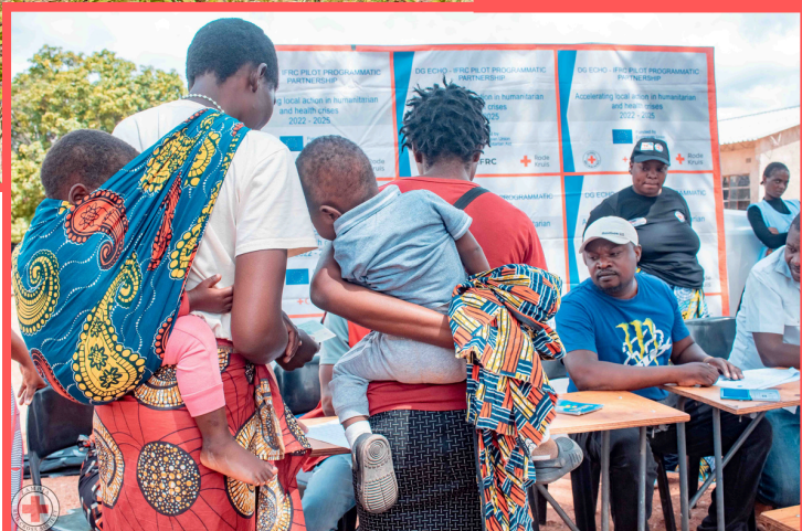
Beneficiaries Queue to Receive Emergency Cash Assistance in Chikankata District, Southern Province