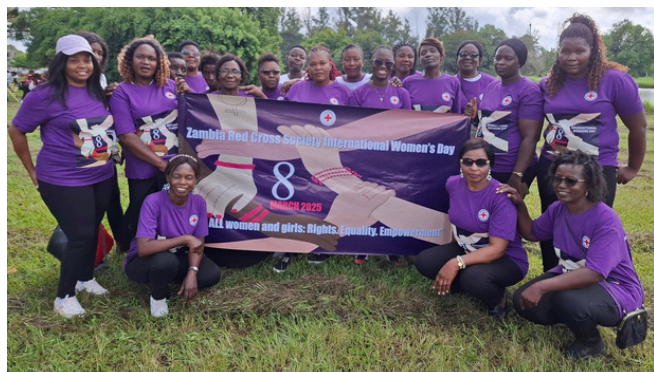
ZRCS volunteers Celebrating Womens Day2025 under the theme: 'For all Women & Girls: Rights, Equality & Empowerment.'

2025 WOMEN'S DAY THEME: FOR ALL WOMEN & GIRLS, RIGHTS, EQUALITY & EMPOWERMENT