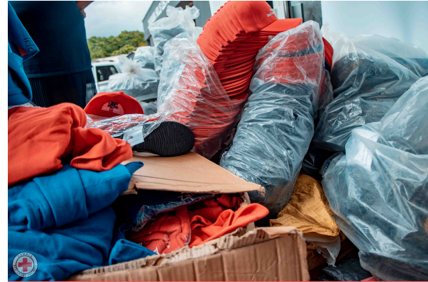
The Donated Items Aimed Strengthening Cholera Response by Boosting Safety for Cholera Responders

These items will play a crucial role in the Case Area Targeted Intervention (CATI) approach, which focuses on rapid response within the critical 48-hour window. Health teams will use the gear while disinfecting homes, testing water sources, and sharing life-saving information with affected communities. This initiative underscores ZRC's commitment to supporting frontline workers in the fight against cholera.