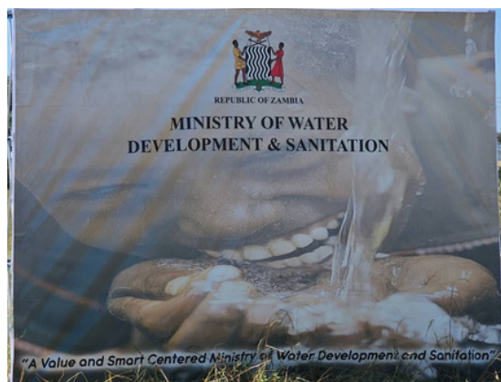
This Year's World Water Day was Commemorated Under the theme Protection of Water Sources Amidst Climate Change and Pollution