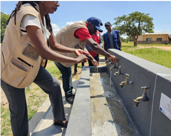
New WASH Infrastructure Brings Relief to Chilumino, Namwala

Board monitoring visits confirms that donor investments like ECHO's translate into tangible improvements for vulnerable communities. Such oversight strengthens both program quality and community trust in ZRCS's work.