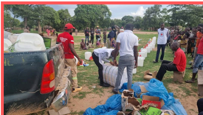
ZRCS Volunteers Distribute Essential Food and Non-food Items to Flood-affected Families in Nyimba Ward, Nyimba District, Eastern Province