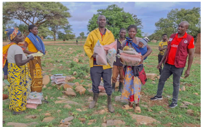
Beneficiaries Receive Farming Inputs from Zambia Red Cross Society Under the Acute Crisis Project, Aimed at Building Strengthening Food security