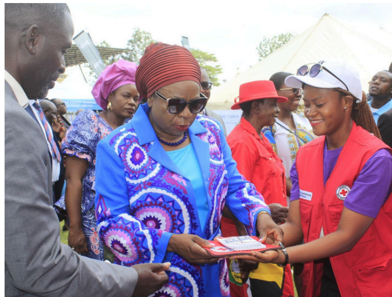
Her Honour the Vice President Mrs. Mutale Nalumango Visits ZRCS Exhibition Stand During Women's Day Celebrations at Showgrounds in Lusaka

Guest of honor at the event Her Honour, the Vice President Mrs. Mutale Nalumango visited ZRCS stand which showcased products alligned to the theme.