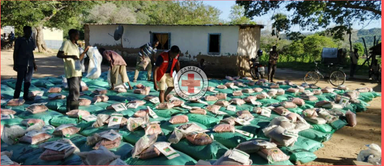
Farming Inputs, Including Seeds and Fertilizers, Distributed to 1,000 Farmers in Siavonga and Gwembe Districts to Strengthen Long-Term Food Security and Sustainability.

Following the 2023/2024 drought, many families in Siavonga and Gwembe districts were affected by the drought and faced food insecurity. On 13 th January 2025, with the support of Netherlands Red Cross, the drought response Project supported small scale farmers with farming inputs to 500 small scale farmers in Gwembe and 500 small scale farmers in Siavonga. Each beneficiary received agricultural inputs such as maize seed, sorghum, cowpeas, okra seeds, and fertilizers, along with capacity building in Climate Smart Agriculture training for 60 lead farmers.