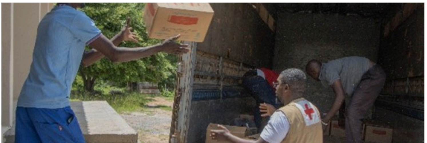
100 Plumpy'Nut boxes donated to Sinazongwe District Health Office