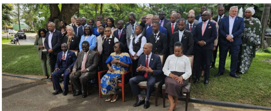
The 2025 SAPRCS meeting, hosted by Zambia Red Cross Society, was Graced by the Presence of Her Honour the Vice President of Zambia Mrs. Mutale Nalumango

Zambia Red Cross Society (ZRCS) proudly hosted the Southern Africa Partnership of Red Cross (SAPRC) meeting in Lusaka on 3 rd April 2025 at Southern Sun Hotel. The high-level gathering brought together Red Cross and Red Crescent top leadership from 10 Countries, Partner National Societies, and International Federation of Red Cross and Red Crescent Societies (IFRC) and International Committee of Red Cross and Red Crescent (ICRC).