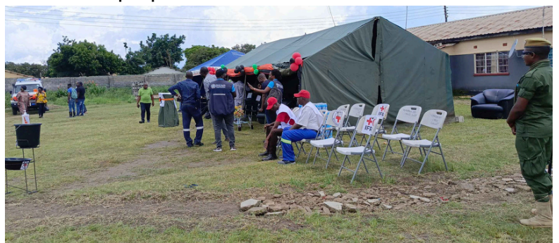
Oral Rehydration Point Set Up in Chililabombwe

The results speak for themselves: more families now purify their water, practice good hygiene, and seek help quickly when symptoms appear. Our strengthened Oral Rehydration Points in busy areas like Kasumbalesa provide immediate care, while improved data collection helps target responses effectively. Thanks to these efforts, cholera cases have dropped significantly. ZRCS remains committed to building community resilience against outbreaks. Together, we're proving that prevention and preparedness can transform health outcomes.