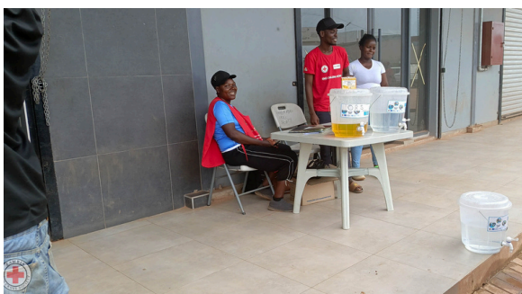
Volunteers set up an Information Desks and Oral Rehydration Point

When cholera hit Chililabombwe earlier this year, Zambia Red Cross Society (ZRCS) sprang into action. Working with partners, our teams distributed chlorine, set up Oral Rehydration Points and centres, and launched community education campaigns. From markets to schools, we've reached thousands with life-saving information on hygiene and early treatment.