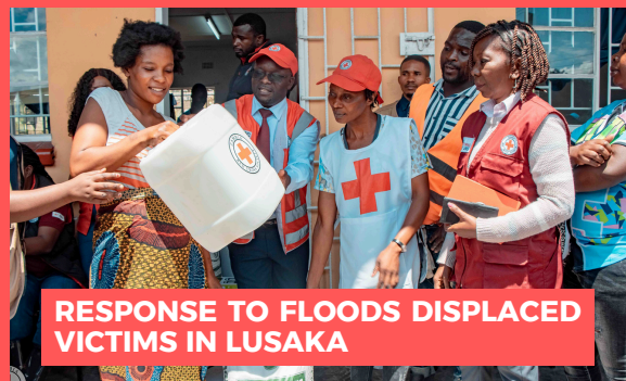
RESPONSE TO FLOODS DISPLACED VICTIMS IN LUSAKA