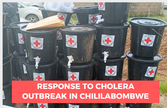
RESPONSE TO CHOLERA OUTBREAK IN CHILILABOMBWE