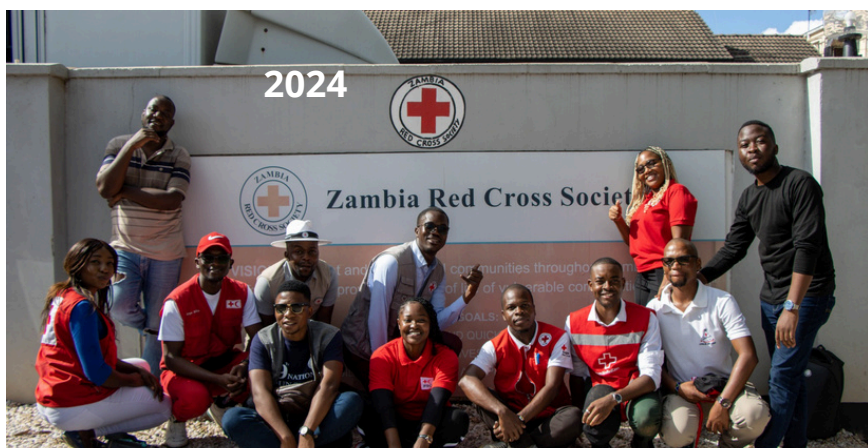
Youths from Southern Africa National Societies During the Landmark SAPRCS meeting Held in Lusaka