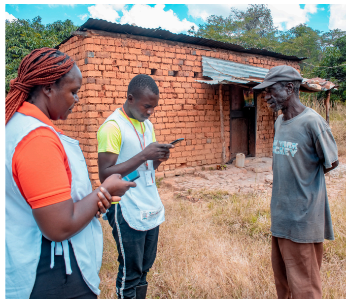
A ZRCS Volunteer Conducts Door-to-Door Mapping to Assess the Immunization Status of Children Under Two Years Old.