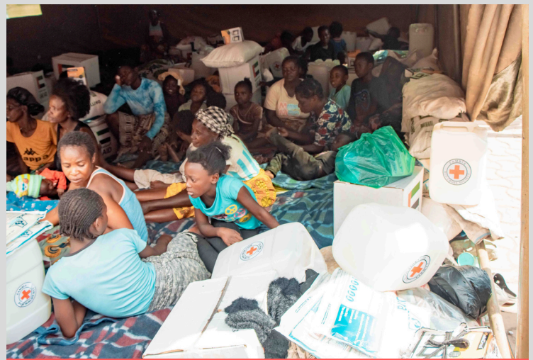
85 Flood-Affected Families Find Shelter at Chaisa Youth Skills Development Centre