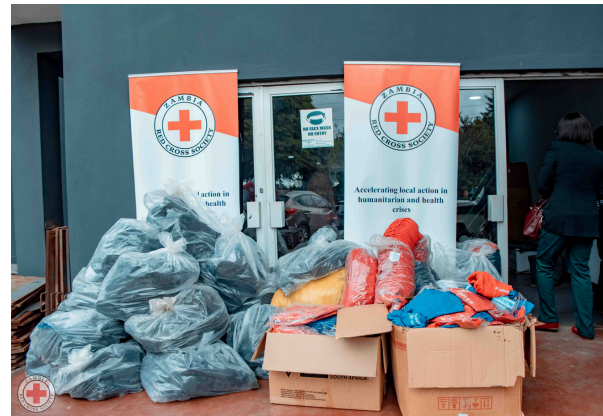
Donation to Lusaka District Health Office includes 200 Pairs of Gumboots, 200 Raincoats, and 200 T-shirts