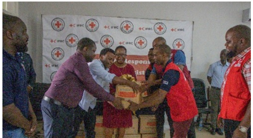
ZRCS Donates Plumpy'Nut to Sinazongwe District Health Office to Combat Malnutrition in Under-5 Years Old Children