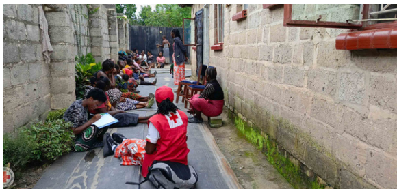
Volunteers Conducting Community Engagement on Cholera Prevention and Treatment