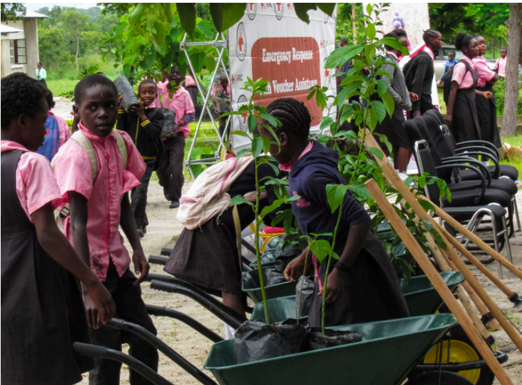
Pupils Eagerly Receive Trees for Planting, Actively Participating in the Green Initiative to Foster Environmental Awareness and Sustainability

This effort is part of the OVC Project's fourth phase, supported by the Japanese Red Cross. By investing in both the environment and education, ZRCS is creating lasting change, one tree at a time.